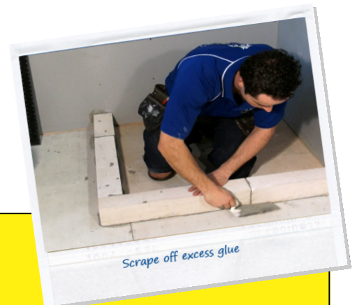
Scrape off excess glue