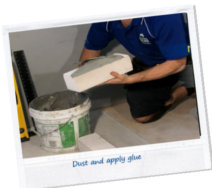
Dust and apply glue