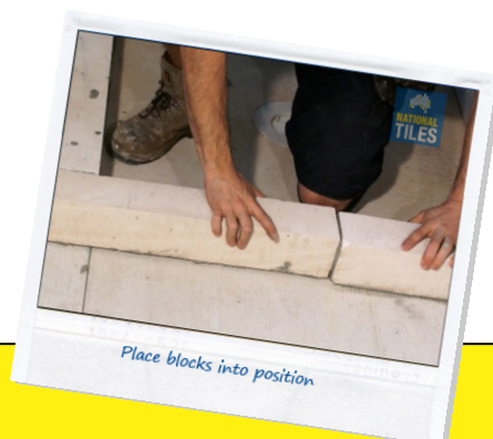
Place blocks into position