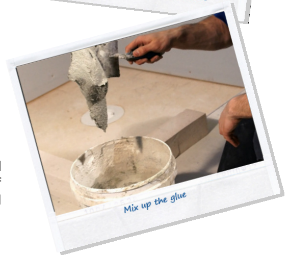
Mix up the glue

Mix the glue by pouring water into a bucket and then add the premix. Continue mixing until you get the consistency of toothpaste. Make sure its not too wet. If it is too wet, add some more mixture until you get it to the right consistency.