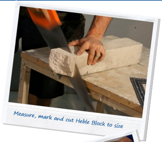
Measure, mark and cut Heble Block to size