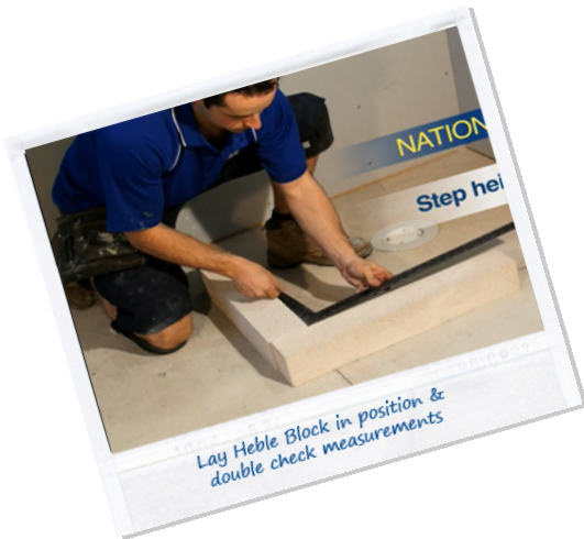
Lay Heble Block in position & double check measurements

To create our hob we are using a Heble Block. This is aerated concrete that is really simple to use. Measure, mark and cut it to size using a standard saw. 100mm is a good height to cut the hob at. Lay it down in position, double check that it's level. Then fix it to the floor.